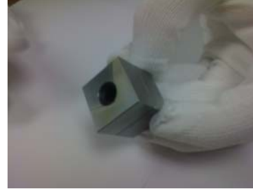
Figure #5 - Gage Blocks Wrung Together

Slide the upper block back into full engagement under light pressure, at which point they should be wrung together ready for use. Worn or dirty blocks will not wring.